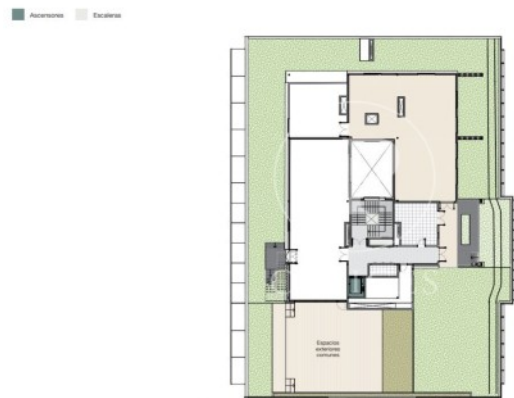
Rooftop 630 m 2