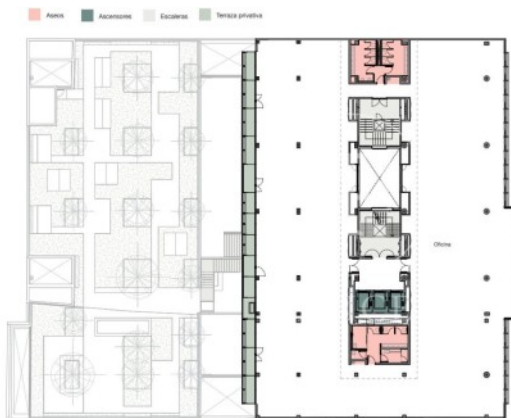
Planta 2 a 5 1.493 m 2