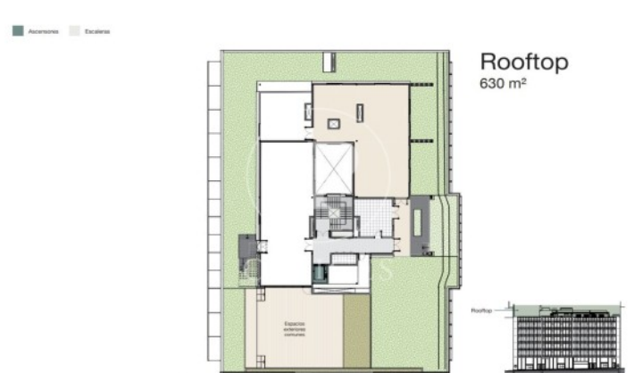
Rooftop 630 m 2